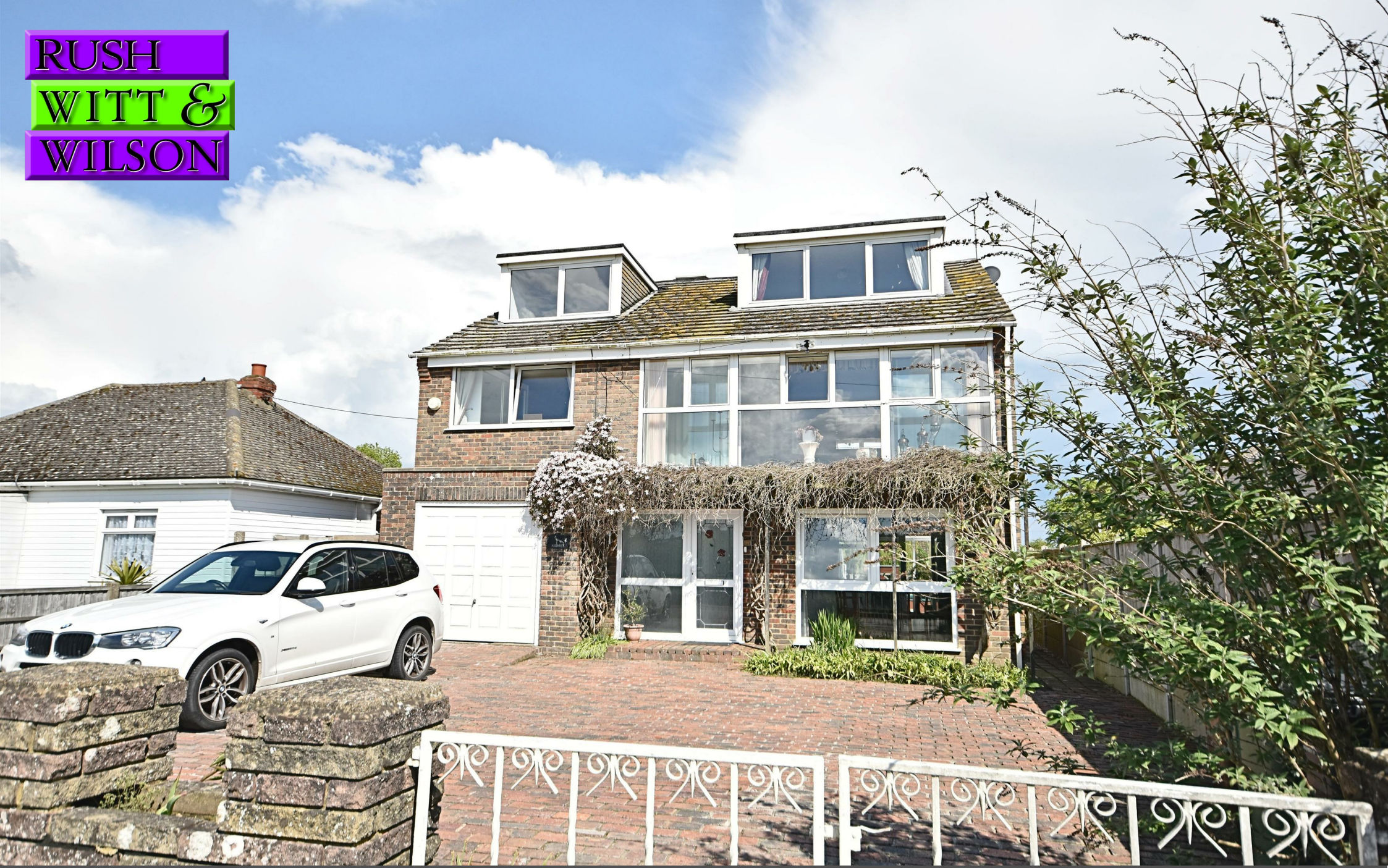
Kismet Sea Road, Winchelsea Beach, East Sussex TN36 4LD Guide Price £650,000